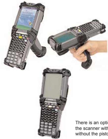
There is an option for the scanner with or without the pistol grip.